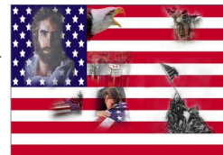
Memorial Day - Monday May 28th